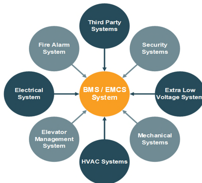
Figure 1: High-Level View of the Configuration of BMS and MEP Systems

The diagram below provides the Operational Team a high-level view of the configuration for all associated systems.